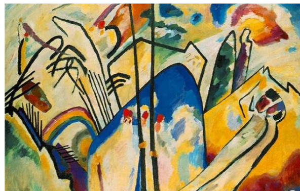
Composition IV 1911