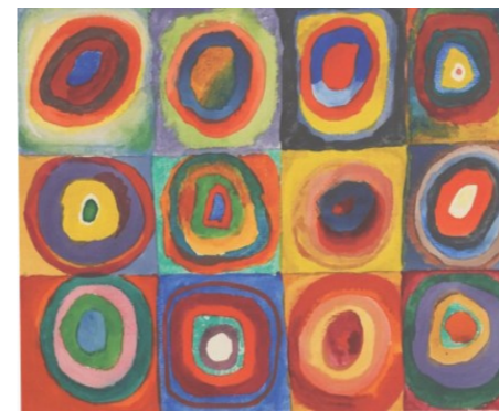
Squares With Concentric Circles 1913