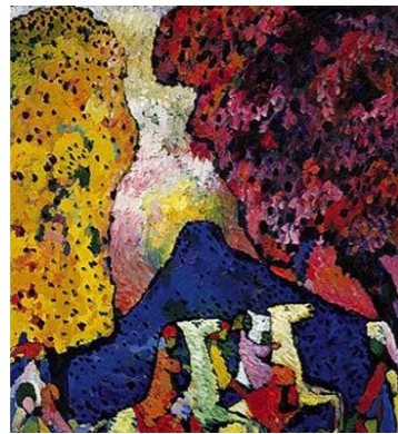
Der Blaue Berg (The Blue Mountain) 1908