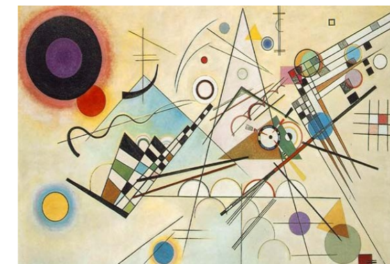
Composition VIII 1923