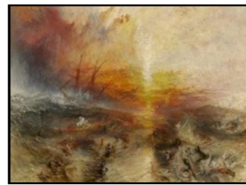
The Slave Ship 1840