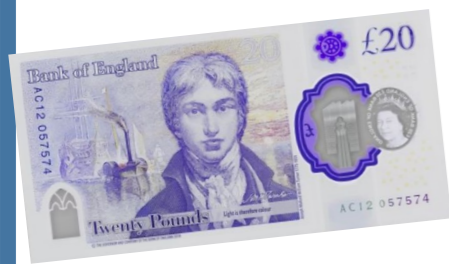
In February 2020, the face of JMW Turner and was the first £20 note printed on polymer plastic.

Step 5: Add any finer finishing touches to your painting and then leave it to dry.