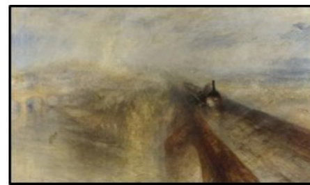
Rain, Steam and Speed 1844