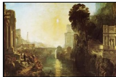
Dido Building Carthage 1815