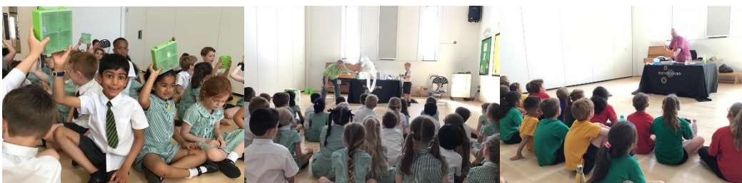
(ABOVE) This week Science Oxford visited us to deliver some exciting science workshops. Lots was learnt and plenty of fun was had!

"The New Reception Parent/Carer Induction Talk was very informative on Monday evening and my child enjoyed attending the first stay and play session on Tuesday.