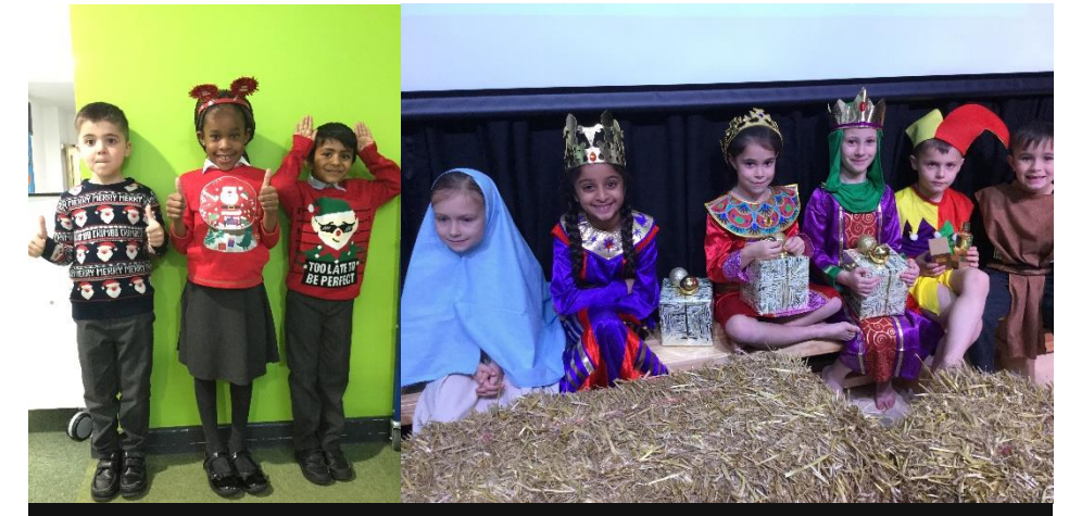
(ABOVE) A photo from Christmas Jumper Day and from the "I'm Going to Shine" performance

"Please pass on my congratulations over to the Reception team. The nativity was wonderful to watch, it was clear a lot of time and effort from the staff had been put in. The children were fantastic and clearly enjoyed themselves."