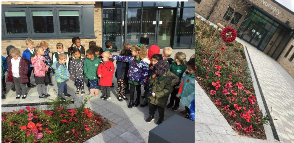
(ABOVE); Our children across the academy came together for our Remembrance Service last Friday at 11.00am