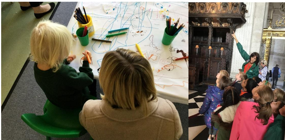
(LEFT) Early Years Stay and Play in Nursery on Monday; (RIGHT) Year Two Oak Class on their visit to London and St. Paul's Cathedral!

Early Years Stay and Play Session 8 th October