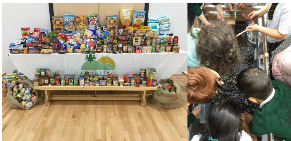
(LEFT) Our wonderful Harvest Festival display; (RIGHT) Children in Reception this week hunting for dinosaur fossils!