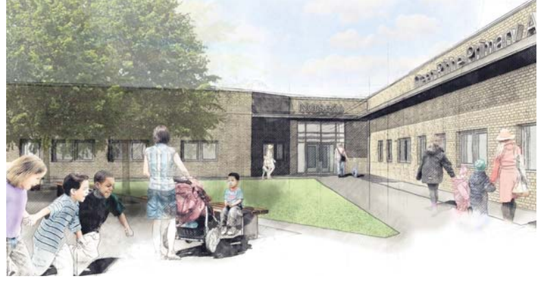
Artistic Impression of the nursery entrance and playground areas